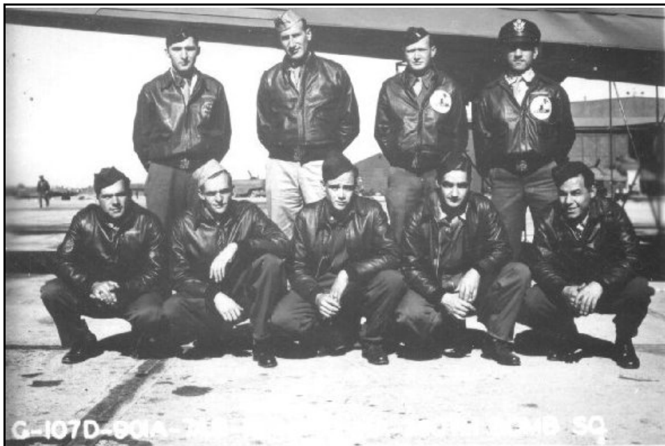
SCHULSTAD CREW - 360th BS

Two squadrons of English Spitfires joined the groups at the French coast, four squadrons provided target support, and six more provided rear support on the withdrawal.